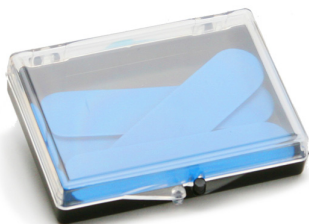
A completed unit