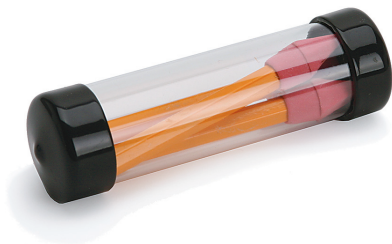
A completed unit