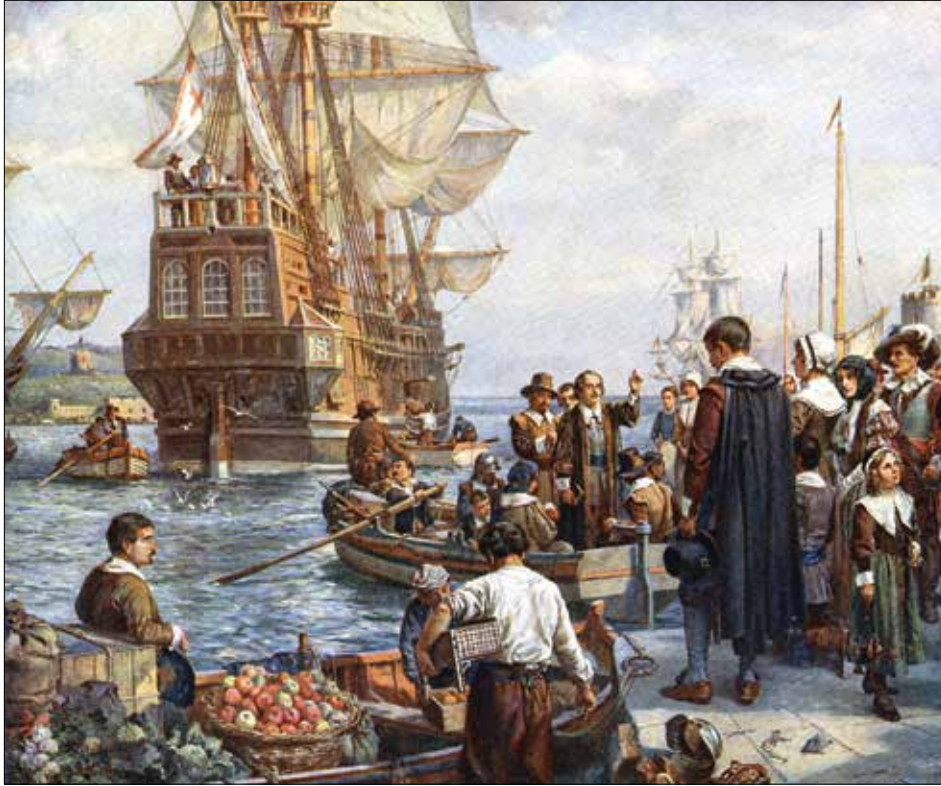
The Pilgrims left England in 1620 on a sailing ship called the Mayflower .

In 1620, only one kind of church was allowed in England. The English king wanted everyone to be part of the Church of England. There was no freedom of religion . In the New World of America, people could have different kinds of churches. A group of people called Pilgrims sailed to America on a ship called the Mayflower . The new home for the Pilgrims became known as New England. Native Americans helped the Pilgrims learn to grow food. More than 150 years later, this land would become part of the United States of America.