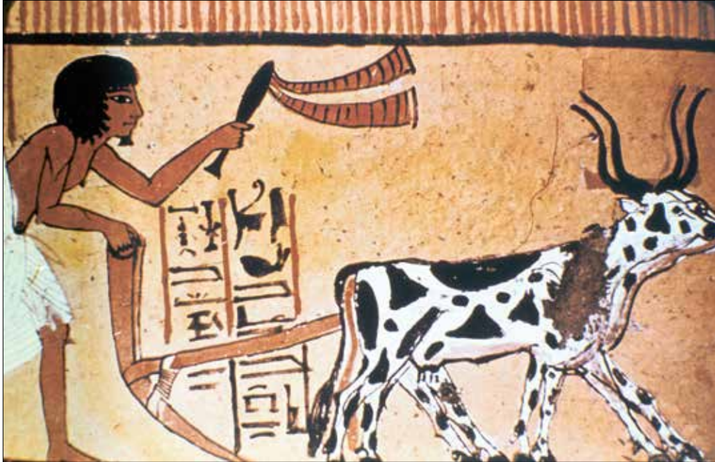
Ancient wall paintings show Egyptian farming.

The earliest humans did not stay in one place. Food they ate came from hunting animals. The animals they hunted moved around. The humans followed the animals so they could hunt them. They also ate fruits and vegetables growing in the wild. When humans learned about agriculture , they could grow their own food. Farm life allowed people to stay in one place.