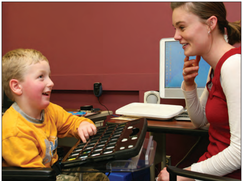
Student setting goals with SLP.

In a single-subject design with three students, the authors found that students' motivation increased with positive mastery of curriculum. Positive outcomes were measured in terms of the percentages of objectives each student achieved, and these were uniformly near 100% for all three subjects. While the generalizability of their findings is limited due to the small number of case studies, consistent effects were found through engaging students in