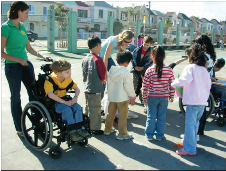
Inclusion across the school day.

learning disabilities, finding the quality of education to be more of a determining variable in the learning outcomes of students than classroom placement. In other words, students who were able to master curriculum on level with their peers without disabilities received high-quality instruction, often in special education resource rooms. These authors identified characteristics of high-quality education as follows: